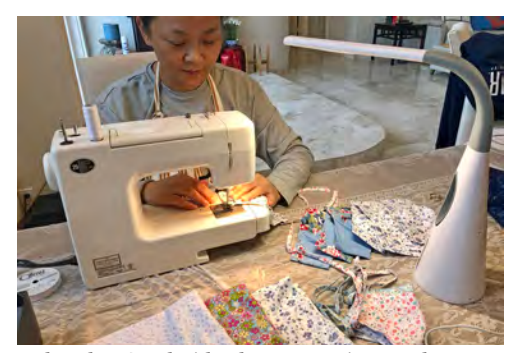
Yuhe Zhu, SE Florida chapter, sewing masks, 2020.