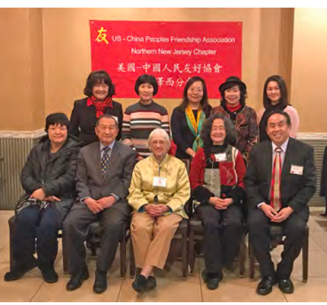
Northern New Jersey chapter.