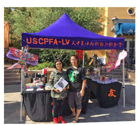
Las Vegas chapter, 2019.